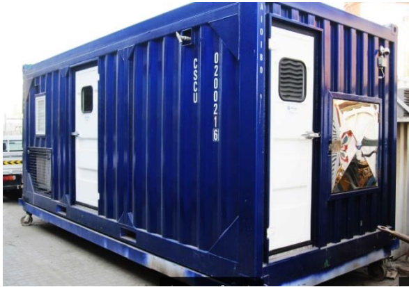
Figure 2: ABS DCON A1500 Container