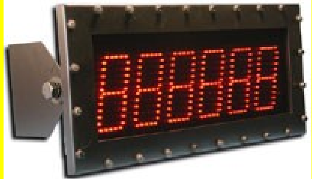
The 12-gauge steel case and 3/8-inch Lexan protects the display from harsh environments