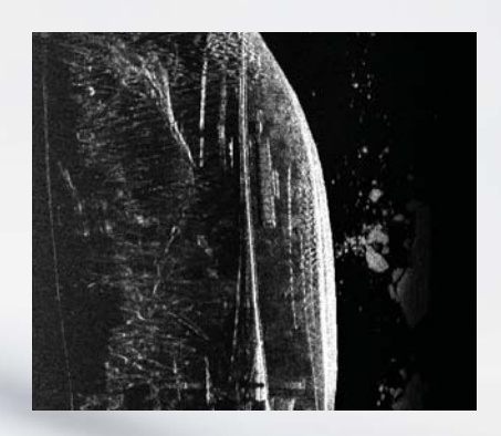
III SHIP HULL SCAN