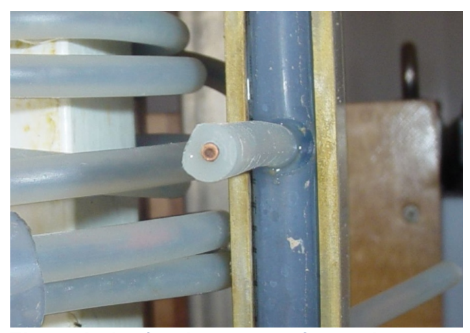
Electrode tip after three years of operation

Zero tip wear is essential for the repeatability of the acoustic pulse, which depends largely on a constant, unaltered electrode surface.