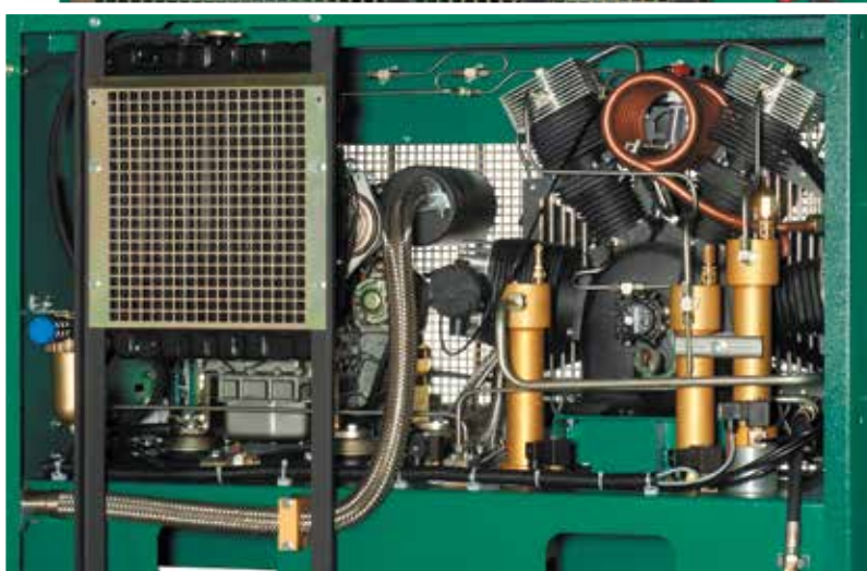
LW 570 D Rear view