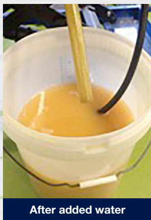
After added water