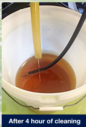
After 4 hour of cleaning

After 4 hours of cleaning, the oil is better than new oil and the reduction of water in the oil after the test is 99.3%. In addition, the reduction of particles after the test is 80.2%.