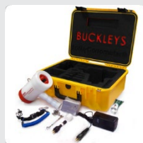
BathyCorrometer® Pro' 6004-0078