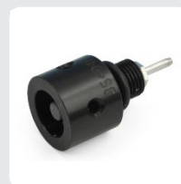
Silver/Silver Chloride Screw- in Half-Cells 6004-0051