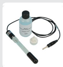
Glass K-Series Reference Cells 6004-0013