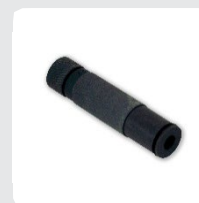
K-SAT Reference Cells 6004-0111