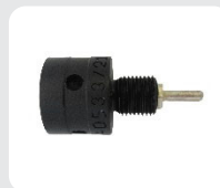
Silver/Silver Chloride Half Cell 6004-0051