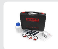
Calibration Kit 6004-0032