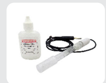
Glass K-Series Reference Cell 6004-0013