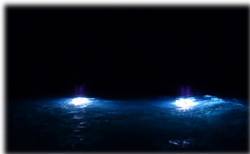
Delta Sparker Pulse

The tips are easily replaceable for simple field maintenance.