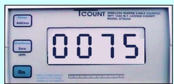
DTD254 Desktop display can be used as main display or as a repeater