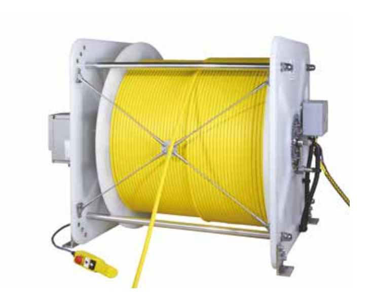
MK8 electric winch